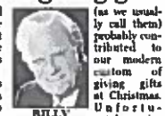
BILLY GRAHAM My Answer

A: Shortly after Jesus was born, a small group of men traveled hundreds of miles to pay Him homage and give Him gifts. When they finally discovered Him, the Bible says, "they bowed down and worshiped him. Then they opened their treasures and presented him with gifts of gold, frankincense and myrrh" (Matthew 2:11). Although we can't be certain, over the centuries the example of those "wise men"