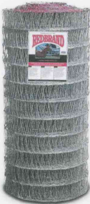
Click above image for larger view

Home » Horse Fence » Keepsafe® V-Mesh Horse Fence 58-in. - 165-ft.