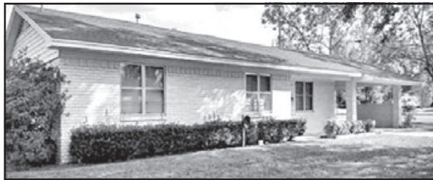
*One-Owner/Well-cared for 3br. Brick.

LEASE PURCHASE ! 3/2 REMODELED. $10k DOWN. PMTS UNDER $800 Includes: taxes and insurance. 317 ELM ST. Owner/broker 903-767-0753