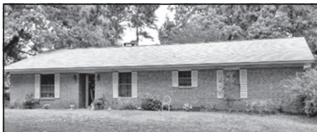
Nice place! 1 acre corner lot. Quite "Country Living."

PropertiesUnlimited.com Call Elaine Barnwell for Details! 903.577.4668